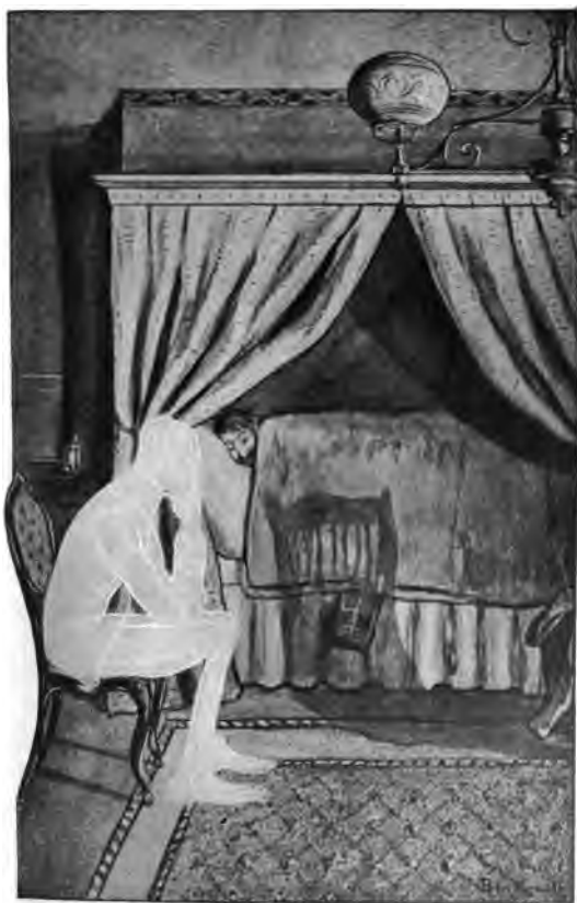
"THE FRIENDLY SPECTRE STOOD BY ME"